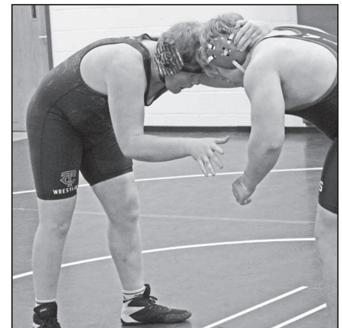
Towns County placed fourth in the team standings with 91 points, edging fifth-place Murphy, NC by 12.